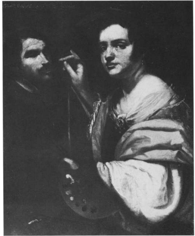
19 Anonymous artist, Portrait of a Woman Artist (as La Pittura?) . Rome, Palazzo Corsini

Despite its thematic connection with the London Self-Portrait and with Cassiano's commission, the Palazzo Corsini painting does not appear to be by the hand of Artemisia, and especially not if it must be conceived as a work of the 1630's. 66 The handling of light is quite different from that seen in the Kensington Palace painting, less specific and less observed. The backlit fleshy protrusion in the sitter's neck, for example, has no counterpart in any documented work, and the shadow cast by the mahlstick on the artist's right forearm would have been impossible to observe, since the mahlstick is positioned at nearly a right angle to the arm. By contrast, Artemisia took great care in rendering light effects naturalistically. Further, although the Palazzo Corsini painting is about the same size as the London picture, its scale is quite different, since the female figure is treated more broadly, with less delicacy, and it fills a larger area of the picture surface than her London counterpart. The poses of the two women, moreover, are very different in conception: the self-image in the London painting is freer in movement and much less stiff, and the spatial positions of her limbs are much better clarified. Finally, the closely comparable hands that hold the brush in the two pictures differ considerably, in overall shape, in