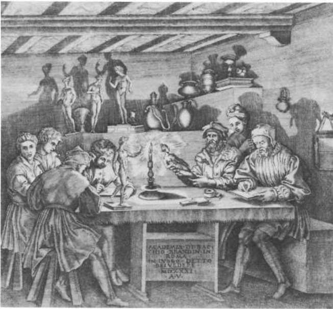
13 Agostino Veneziano, Baccio Bandinelli's "Academy" in Rome