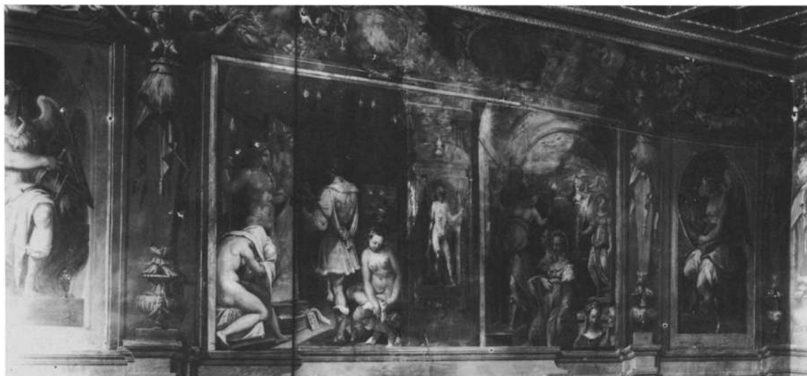
6 Vasari, Sala della Fama. Florence, Casa Vasari

art paralleled and sometimes preceded the foundation of art academies, a phenomenon exemplified by a painting, Athena Introducing Pittura to the Liberal Arts , by Hans von Aachen (Fig. 8), executed in Cologne around the turn of the seventeenth century. 23 In this work, as in the Italian examples, the glorification of art is coupled with enhancement of the social position of the artist through the use of personifications, generally female, to set the narrative on an ideal plane.