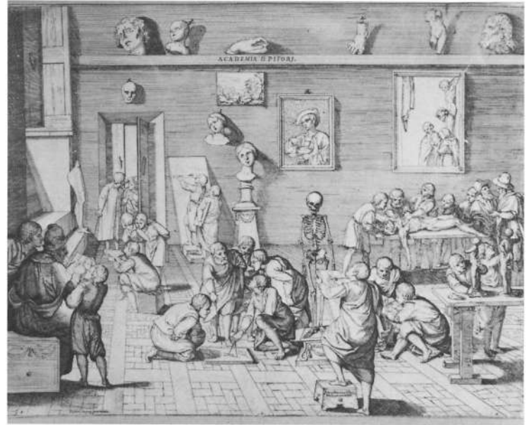
14 P. F. Alberti, Academy of Painters