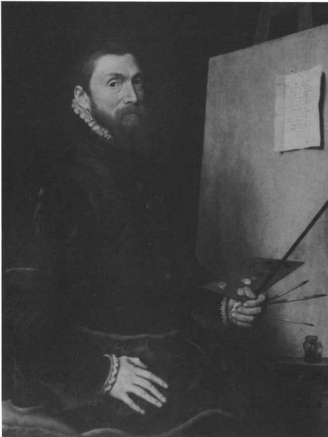
9 Antonio Moro, Self-Portrait. Florence, Uffizi