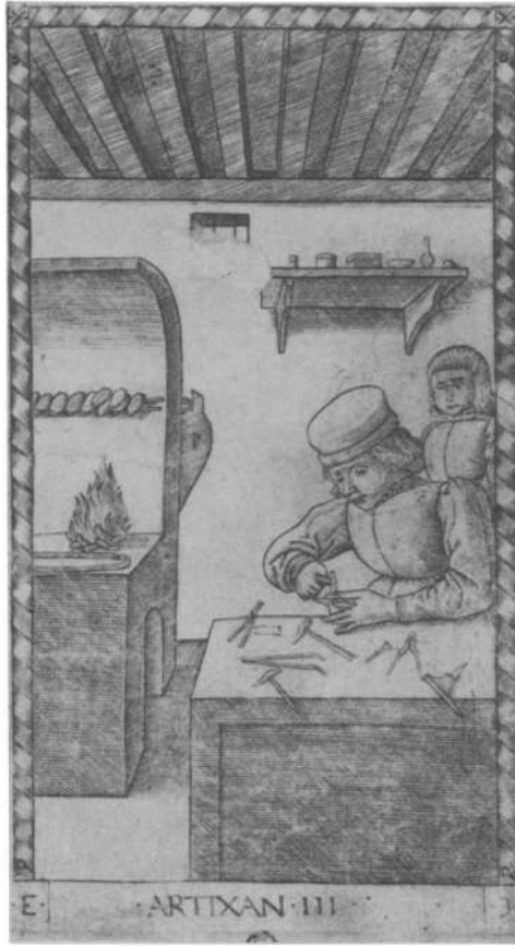
5 The Artisan , Tarocchi engravings, E series

acceptance of Leonardo's point of view: only when the art of painting was understood to involve inspiration and to result in a higher order of creation than the craftsman's product did it become appropriate to symbolize the art with an allegorical figure. It must remain an open question how female personifications originally came into being, yet on an expressive level a female personification for Pittura could usefully signal, through the very unusualness of her connection with an activity largely practiced by men, that she stood for Art, an abstract essence superior to the mere existence of artists. Thus she could assist in conveying the concept that art was separate from the manual labor connected with its making. It may be more than coincidence, then, that Vasari's images of