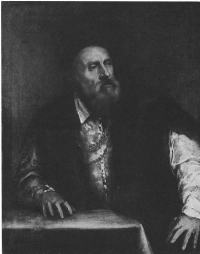
10 Titian, Self-Portrait. Berlin, Gemäldegalerie