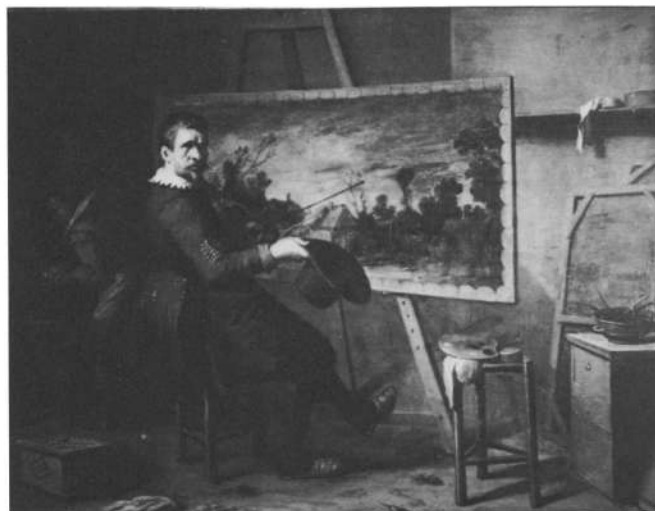
12 J. C. Droochsloot, Self-Portrait in the Studio . Mâcon, Musée Municipal des Beaux-Arts

Baccio Bandinelli stands out in the sixteenth century as one artist who was able effectively to convert the image of the artist's studio into a metaphor for art itself in its higher, unmechanical aspects. The engraving of 1531 by Agostino Veneziano of Bandinelli's "academy" (Fig. 13), and a counterpart engraved some twenty years later by