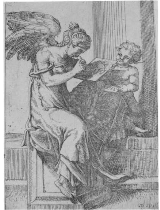
3 Passerotti, La Pittura .

symbol for that art, indicating the moment of its social and cultural arrival. In the Middle Ages, painting, sculpture, and architecture had not been included among the Liberal Arts. The Trivium (Dialectic, Rhetoric, and Grammar) and the Quadrivium (Arithmetic, Geometry, Music, and Astrology) were established as the canonic seven arts in the fifth-century allegorical treatise of Martianus Capella, and in manuscripts and in sculptural cycles they were usually depicted as female figures, following the Roman tradition of allegorical personification, although the artes