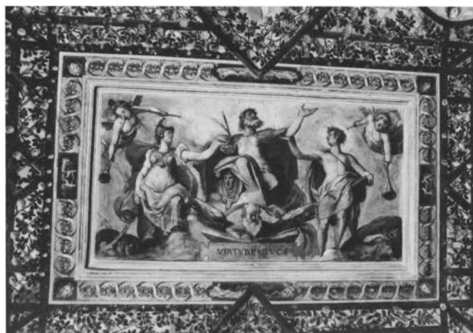
7 Zuccaro, Apotheosis of the Artist. Rome, Palazzo Zuccaro, ceiling

Another mode of propagandizing for the status of art, and the second thematic tradition to be examined here, was self-portraiture in which the artist's personal status as a gentleman was emphasized. Self-portraits such as that by Antonio Moro in the Uffizi (Fig. 9) in which the artist stands before his easel, holding palette, brushes, and mahlstick, yet with the menial implications of these tools offset by his fine clothes and by the attachment to the blank canvas of a poem written in Greek, were clearly intended to place the painter among the learned and to differentiate him from the mere artisan. 24 An even more pointed expression of the social prestige of the artist can