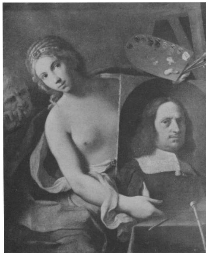
17 G. D. Cerrini, Allegory of Painting with Self-Portrait of the Artist. Bologna, Archiginnasio