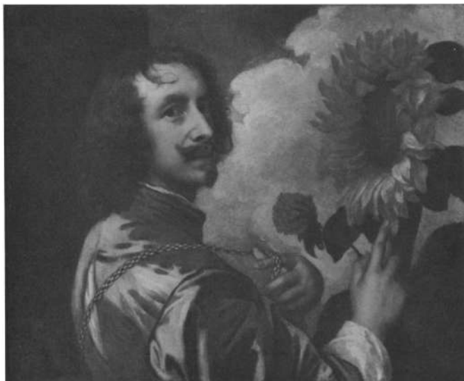
16 Van Dyck, Self-Portrait with Sunflower . London, Collection, Duke of Westminster