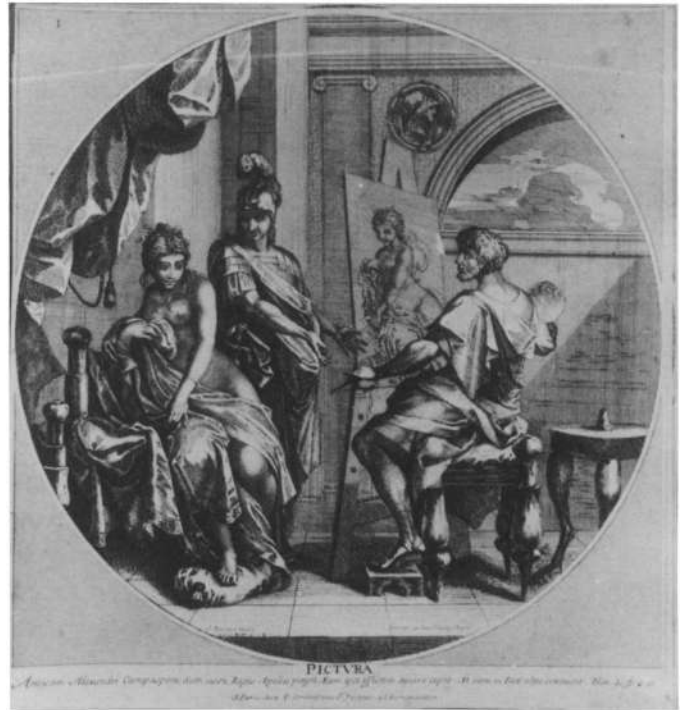
11 Sebastien Bourdon, Apelles Painting Campaspe, labeled Pictura

be found in the numerous self-portraits of the sixteenth and seventeenth centuries that depict the artist wearing a golden chain, a reminder of the rank conferred upon him by a ruler. Perhaps the noblest example of this genre is Titian's Self-Portrait of ca. 1550 in Berlin (Fig. 10), which shows the painter wearing the tokens of rank given him twice by the Emperor Charles V. 25 Such an expression of the social exchange between ruler and artist, and of their comparable prestige, had as its original model the relationship between Alexander the Great and Apelles, symbolized in the story of Alexander's gift to the artist of Campaspe, the Emperor's favorite mistress and the painter's model. This legend became a popular theme in its own right in Renaissance art, as well as a metaphor for the exalted status of painting, a development that is illustrated in a print designed by the seventeenth-century French artist Sebastien Bourdon (Fig. 11), in which the Apelles and