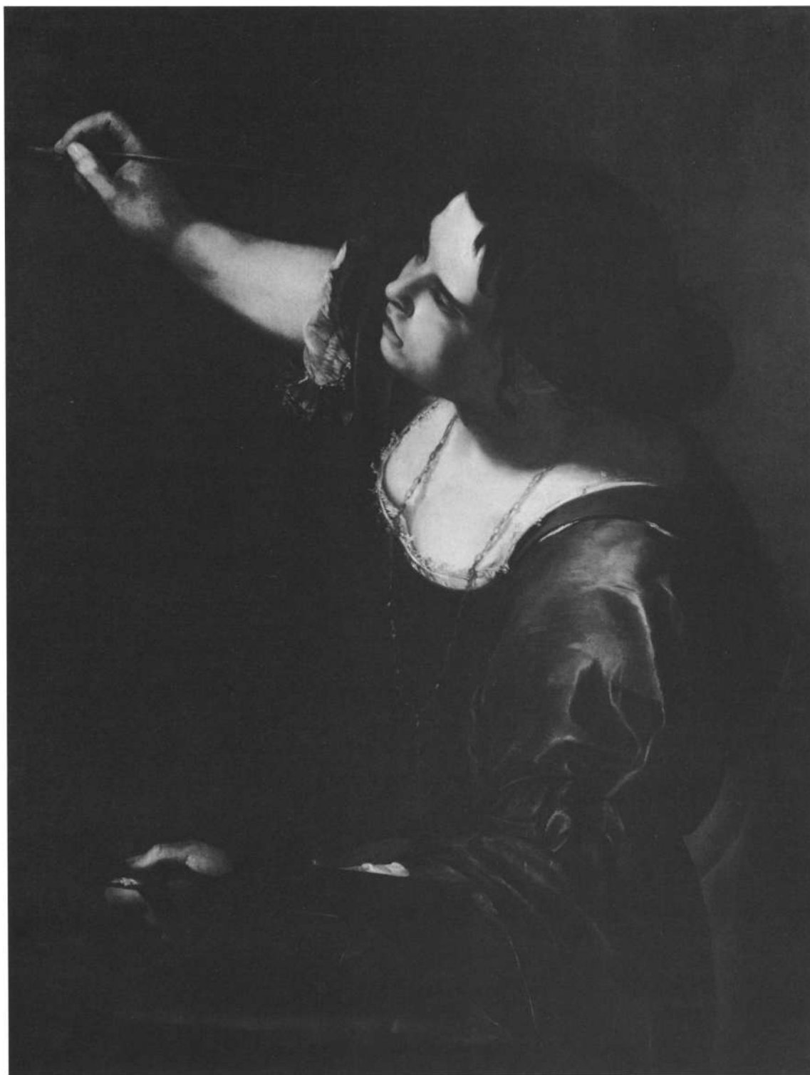
1 Artemisia Gentileschi, Self-Portrait as La Pittura . London, Kensington Palace, Collection of Her Majesty the Queen

century engraving representing Pittura by Bartolommeo Passerotti (Fig. 3), 6 and she appears in art with increasing frequency in the later sixteenth and the seventeenth cen-